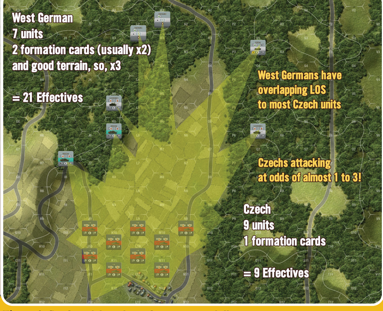
Figure 4: Czech tank battalion advances into a kill-zone.

After two turns, it is likely the Czech's will be no longer combat effective. The cultivated hexes give the tanks no Defensive bonuses and also cost 2 Movement Point's to move through, slowing them down. The West German Effective Numbers are almost 3 to 1 over the Czechs!