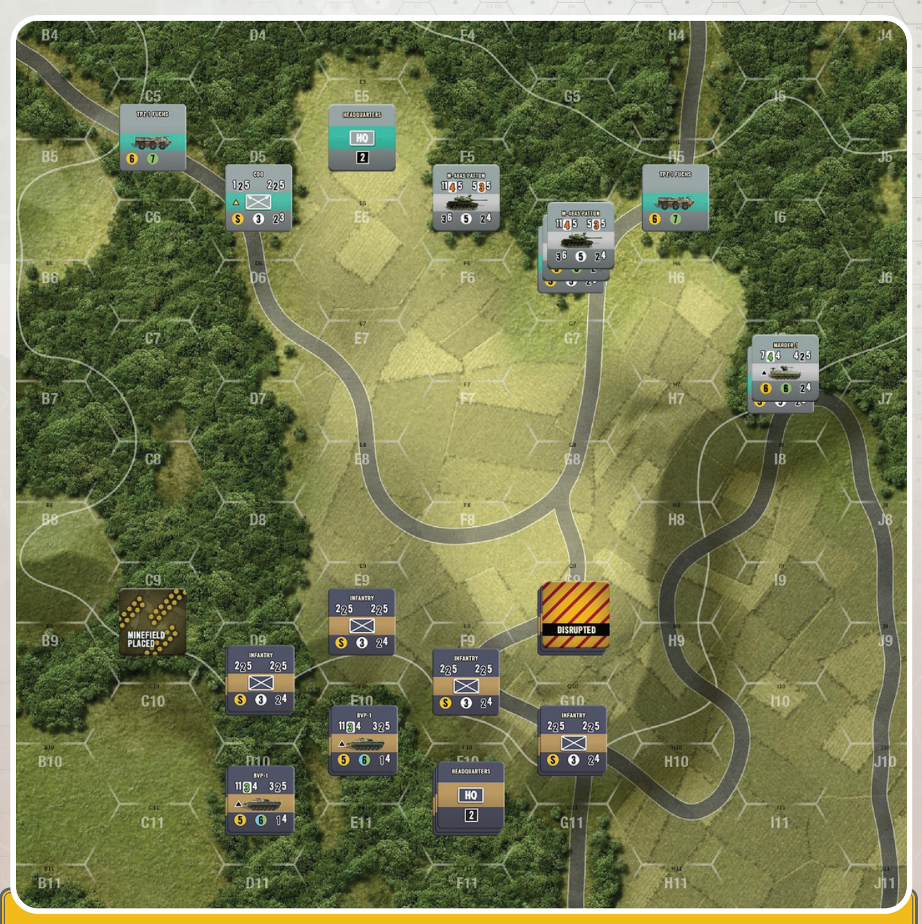
Figure 3: Czech infantry performing dismounted attack. It costs 1 Movement Point for infantry to move through cultivated hexes, and will also provide them a Defensive Bonus while approaching.